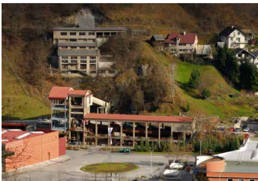
Fig. 2: Idrija Mercury Mine smelting plant area in 2007 (photo by Jani Peternej, 'Heritage of Mercury. Almadén and Idrija' nomination dossier presented to UNESCO in January 2011).

The costs of preparation of the documentation and the execution of rehabilitation and other previously mentioned works in the smelting plant area, which were conducted in line with conservation requirements 15 and in the period from 1995 to 2015 totalled EUR 523,100, were covered by the Idrija Mercury Mine from its own funds in the amount of EUR 160,700, the Ministry of Culture in the amount of EUR 345,700, and by the Kolektor factory in the amount of EUR 16,700 (disassembly and relocation of Čermak-Špirek furnace).