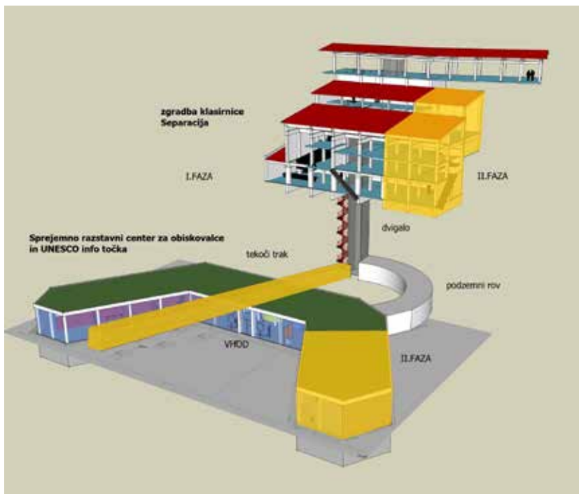
Fig. 4: Drawing of 1st phase of reconstruction of the ore separation plant and construction of the visitors reception and exhibition centre (Rafael Bizjak, 2014); note: yellow section designates area that will not be realised in 1st phase.