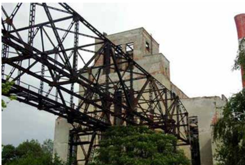
Fig. 5: Construction works during 1st phase of Smelting plant project in May 2016.

By resolution of the Government Office of the Republic of Slovenia for Development and European Cohesion Policy on the approval of the project and the granting of funds (Resolution no. 4300-288/2014/13 dated 30 December 2014), the project duration period began on 30 December 2014 and, in line with the approved extension of the deadline for completion, which in the application had been foreseen on 30 April 2016, will be completed by 31 December 2016.