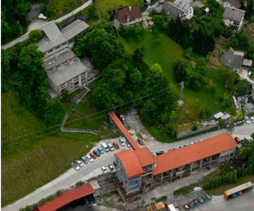
Fig. 3: Idrija Mercury Mine smelting plant area in 2007.